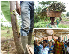
Clockwise from left: Grafting high-value cocoa varieties, harvesting secondary crops as an income source, a program's success relies on the involvement of women in the local communities.

Farmers are planting local timber species for shade and long-term income as well as papaya, cassava, and plantains that provide shade and climate resilience for young cocoa trees while diversifying and increasing family incomes.