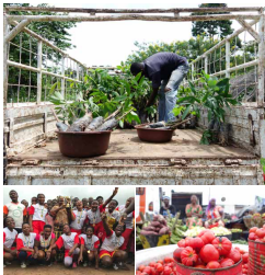
Clockwise from top: Shade trees are prepared for planting, tomatoes from a women-run greenhouse for sale at a local market, women of the women's soccer tournaments.

Training on agroforestry systems, reforestation, forest preservation, and protecting local water sources.