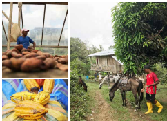
Clockwise from top: A farmer in Ecuador watches over drying cocoa beans, a farm home in Esmeraldas, newly harvested cocoa pods.

Innovative on-farm training for the community-based production of micro-nutrients, natural insecticides and compost help build soil health and protect local water sources.